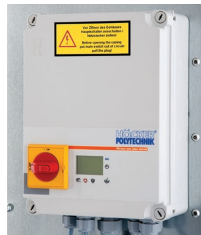
Illustration to the right: PLC controller with text display and robust membrane keyboard